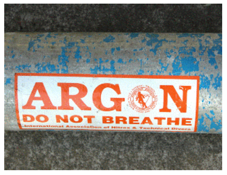
Figure 6 Clear tank markings, dedicated tank service, repeated analysis of gas composition and pressures are all key components for enhancing the safety of mixed gas diving.

Water vapor from perspiration will condense in the undergarment, increasing the fabric's conductivity and diver heat loss. Steps should be taken to minimize perspiration, or a vapor barrier should be employed between the diver and the insulating undergarments.