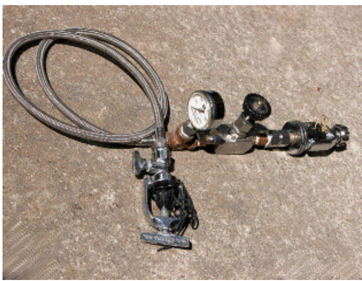
Figure 3 DIY O<sub>2</sub>-Clean gas transfer whip. Stainless steel fittings are used for components that are changed frequently.

Figure 2 A pressure gauge, coupled to a standard industrial pneumatic fitting, is used to adjust the inflation regulator's interstage pressure and also the pressure relief valve's blow-off pressure. Other fittings are shown as examples of other convenient utilities that can be hooked-up to SCUBA for purposes such as lift bag inflation, or driving a booster pump.