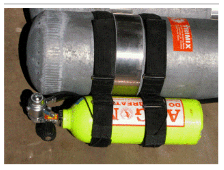
Figure 5 A large tank-mounted pony bottle is not as streamlined as a small bottle fixed to the back plate. Nonetheless, one fill supports multiple dives and even a very low pressure partial fill will be adequate for a long decompression dive.