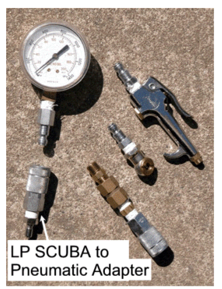
Figure 2 A pressure gauge, coupled to a standard industrial pneumatic fitting, is used to adjust the inflation regulator's interstage pressure and also the pressure relief valve's blow-off pressure. Other fittings are shown as examples of other convenient utilities that can be hooked-up to SCUBA for purposes such as lift bag inflation, or driving a booster pump.

Some of the other suit inflation candidates considered in the article Why Argon? require fittings that are not commonly available. Nonetheless, for completeness, we'll consider less practical gases, such as carbon dioxide and sulfur hexafluoride, which are supplied in a liquefied form. There are efficient ways to transfer liquefied gases from cylinder to cylinder, involving heaters and snorkels, however, most divers would prefer to rely on a simple gas transfer hose. If you did use a fill whip to transfer gas from a liquefied source to a suit inflation bottle, the process would be slow and pressure in the suit bottle would be few hundred psi (10s of Bar) --at most. Even if you could transfer liquefied gas to your inflation bottle, the possibility of shooting liquid into your suit should discourage you from doing this. In an extreme case, the high pressures and low temperatures at depths in excess of 500 ft (150 m) could also cause a number of problems with SF<sub>6</sub>. The gas in the diver's suit would tend to revert to liquid, and the equilibrium vapor pressure of the gas over liquid in the inflation bottle would not be